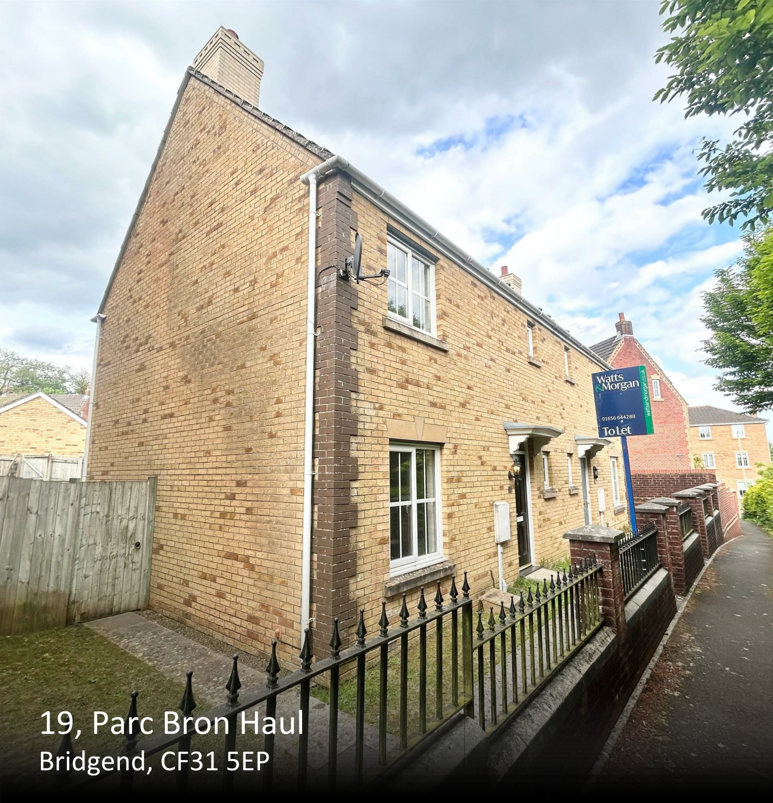
19, Parc Bron Haul Bridgend, CF31 5EP